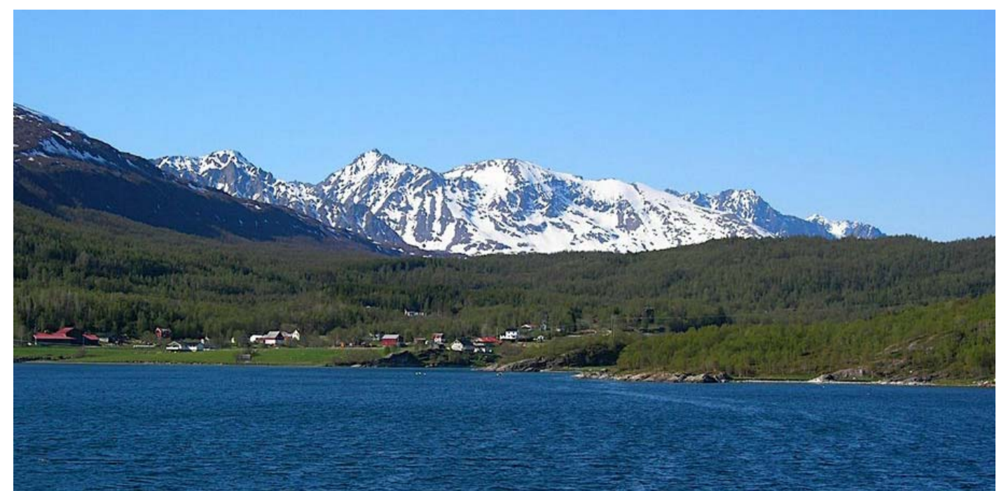
Tromsø in summer: A view of Tromsø Island from the fjellheisen cable car (top); The nearby Lyngen Peninsula (above); Sailing into town under the midnight sun, which will be up during the symposium (left).